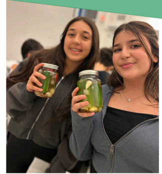
It was an amazing week of pickle making, girls reunion Shabbaton in Las Vegas and meeting up, ice creaming and Kahooting in Arizona!

Upcoming programs, events and assorted other stuff you should know about: